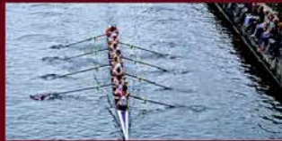
Inlet Rowing Club Come and Try Event May 30, 2019