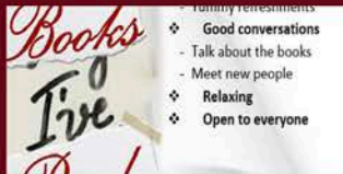
Book Club – New at Heritage Woods May 30, 2019