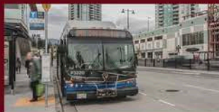
Do you ride the bus? May 30, 2019