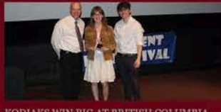
KODIAKS WIN BIG AT BRITISH COLUMBIA STUDENT FILM FESTIVAL. May 30, 2019